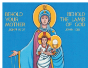
Catholic Charities - Immigration Services